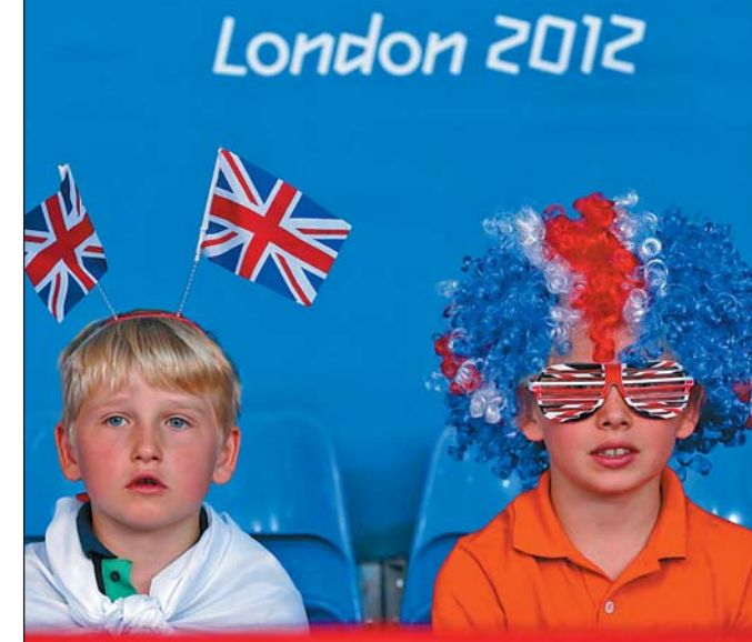
Young spectators show their true colors at the Games on Tuesday.