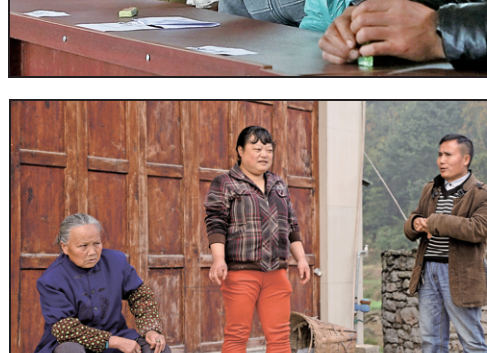
In the remote village of Lequn, hidden in a mountainous corner of Liupanshui city, Guizhou province, nearly 400 villagers — 10 percent of the residents — have physical disabilities, almost double the national average